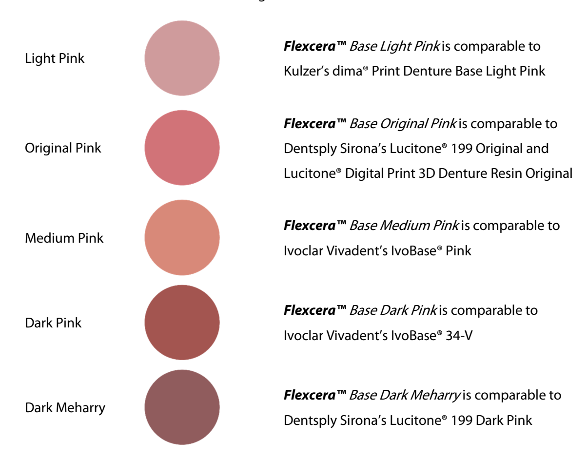
Flexcera™ Base is available in the following colors: